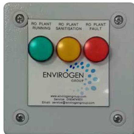
Remote wall-mounted alarm indicator