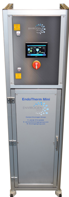
An EndoTherm Mini simplex RO System