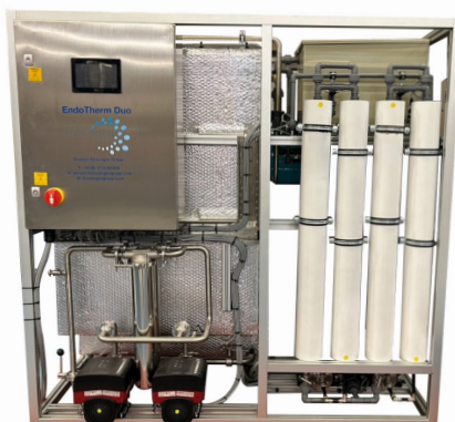
A duplex EndoTherm Duo XL RO system