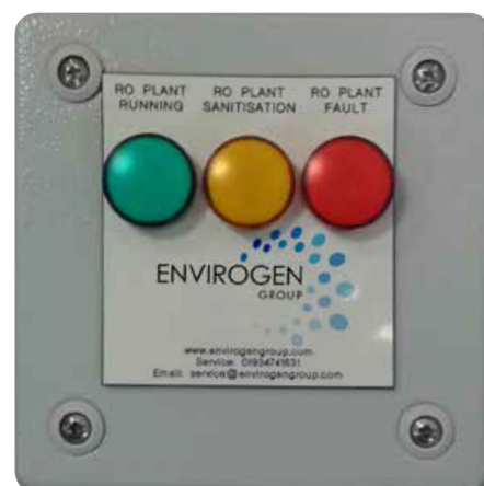
Remote wall-mounted alarm indicator