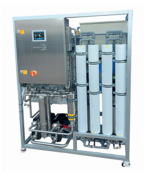
An EndoTherm Duo duplex RO System